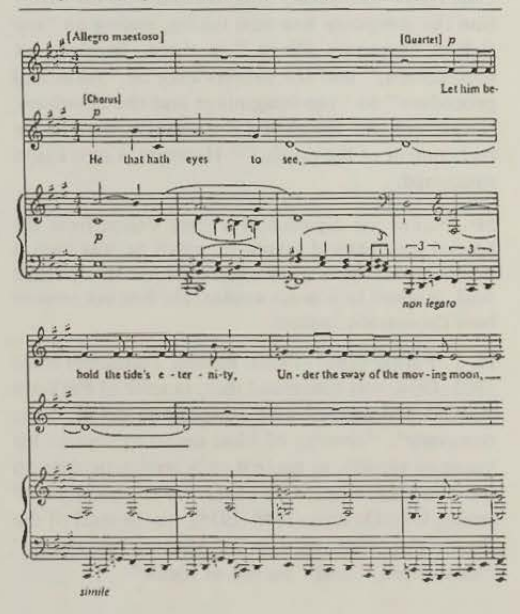
Example 7. Excerpt, "On Earth," Morven, p. 181, m. 8-p. 182, m. 5.

Parker in his most advanced phase of harmonicmelodic writing. After A major, the C _{\pm} seventh chord emerges in the second measure through a cloud of intense appoggiatura activity in the inner lines and suggests a transient modulation to F _{\pm} . The